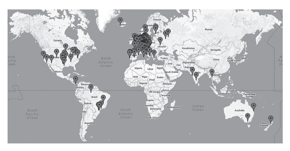
FIGURE 3. A MAP OF SENSORS REGISTERED TO THE OPENSKY NETWORK (MARCH 2017).

As of April 2017, the OpenSky Network consists of 260 registered and 300-450 anonymous sensors streaming data to its servers. Registered sensors are those operated by active members of the OpenSky Network community. Their operators are usually known to the administrators, either because the sensor was provided by the network itself or through personal contact. In contrast, the operators of anonymous sensors are unknown. While the exact locations of anonymous sensors are also unknown, they can be approximated based on their coverage and IP address. The locations of registered sensors are known with an accuracy of 10 meters.